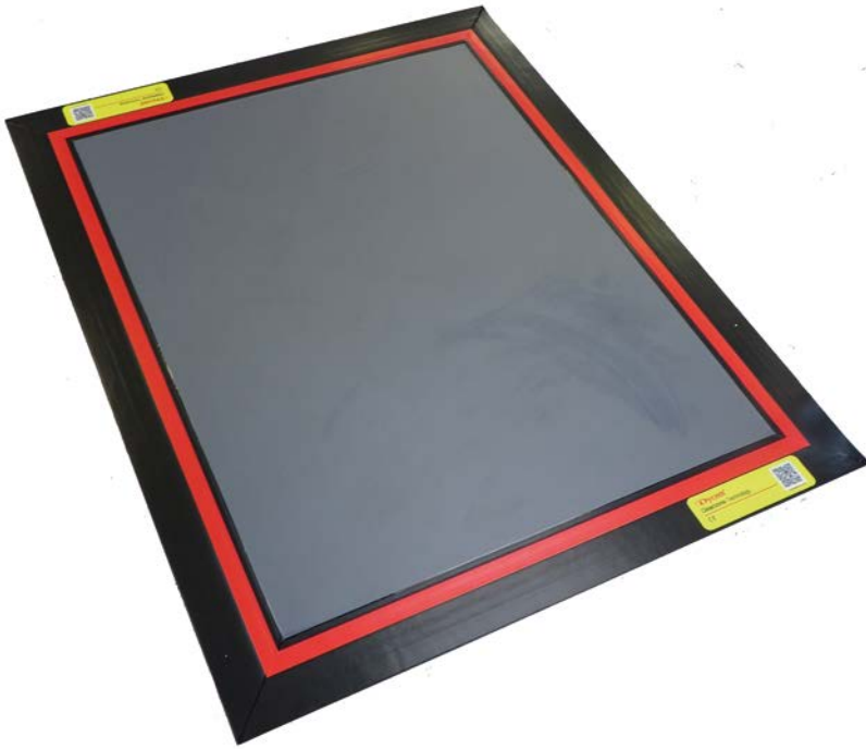
EXAMPLE OF THE FLOATING FLOOR MAT